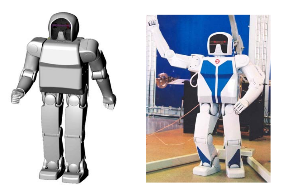
Fig. 1. SolidWorks model and photo of ARNE-02

Especially for robot arms and legs low-speed brushless DC 16 and 60 W motors were developed by NE Company. They are used with Harmonic Drive's wave gearheads. Head and hand motors are DC micromotors by FaulHaber DC Motors. Microencoders 2048 impulses per turn and potentiometric sensors are used as rotation degree sensors.