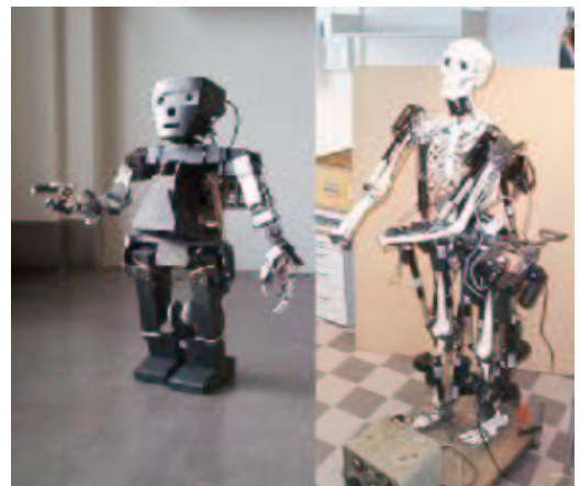
Figure 1: 'elvis' (left) and 'priscilla' (right).

In this paper we briefly introduce three humanoid robot prototypes.