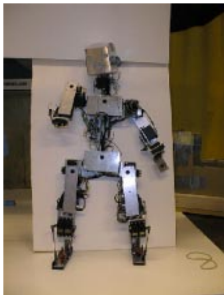
Figure 2: ELVIS without hands

ing. Some system functions are represented as several modules spanning different layers.