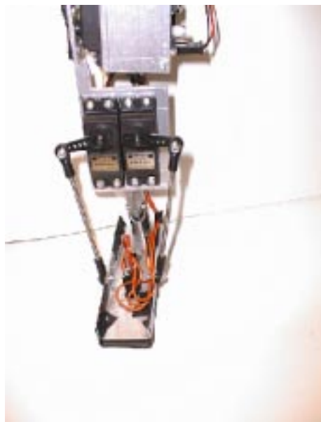
Figure 3: The leg and foot of ELVIS