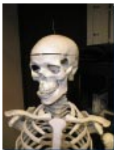
Figure 5: A future humanoid platform

Nature has shown that evolution is a very powerful tool for controlling complex systems in an adaptive way. Our hypothesis is that evolutionary systems such as Genetic Programming and AIMGP are very well suited for control of complicated systems. We have chosen to build the control architecture almost exclusively on EAs operating on a wide variety of tasks and using several different methods for evolution and representation. The experiments are still at an initial stage, but we believe that the hardware and software architecture may be of interest to the research community in EAs, robotics and control. We will use the experiences from ELVIS for the construction of a full-size humanoid robot built on a plastic human skeleton.