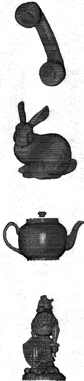
Figure 2: Marching Triangle Reconstruction of 3D Models

Results of implicit surface based fusion of multiple range images using Marching Triangles approach are illustrated in Figure 2. Each data sets contains approximately 10 range images. Integration times correspond to a SUN Sparc 20 workstation. The telephone 1 and bunny 1 images were previously used to demonstrate the mesh zipping integration