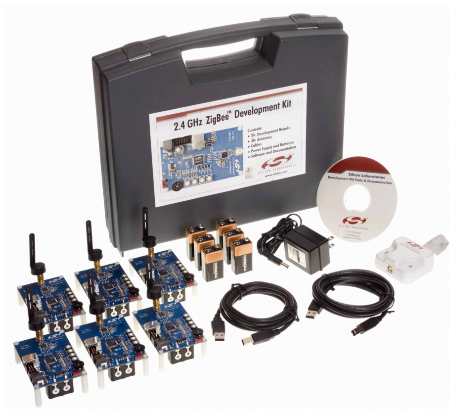
Figure 1. 2.4 GHz ZigBee Development Kit