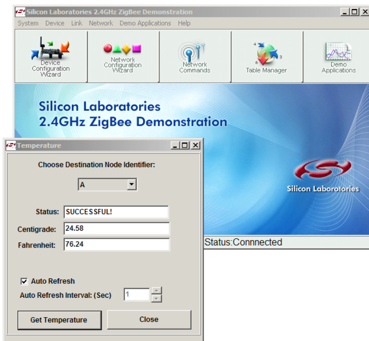
Figure 2. 2.4 GHz ZigBee Demonstration Software

Detailed instructions are in document "AN240: 2.4 GHz ZigBee Demonstration Software User's Guide", included with this kit.